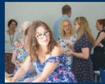
Public engagement Page 7