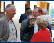
Events report Page 2 & 3