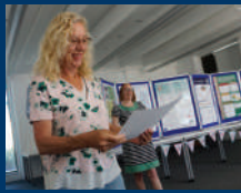
CHSS people Pages 6