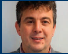
Research news Page 4