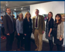
CHSS news Page 2