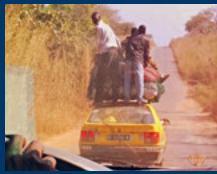
CHSS international Page 4