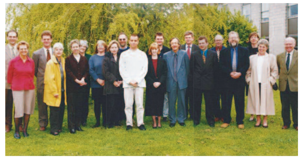
CHSS in 2000 with SEIPH

MDS/RAI; a standardised assessment linked to care planning guidelines for use in post-acute and long-term care of older people. This pilot project aimed to discover if there were any fundamental aspects making it unsuitable for UK use and was the first step in a full formal evaluation